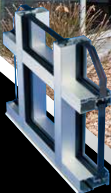
14000 I/O Series Multiplane Storefront Framing