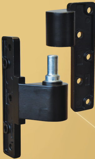
Intermediate Door Pivot