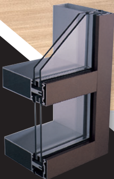
200 Series Curtainwall