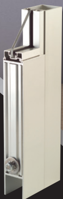
Standard Narrow Stile Entrances

Standard swing doors and frames provide a complete system and come in 7 anodized and 20 standard painted finishes. Gaskets for glass thicknesses from 1/4" to 1/2" are available in Black or Grey as desired. There is also an option for use of recycled aluminum on the storefront members [excludes doors and door frames].