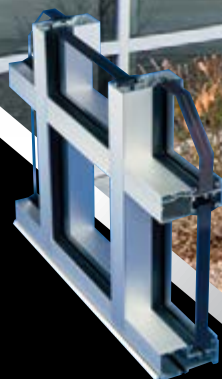
14000 I/O Series Multiplane Storefront Framing