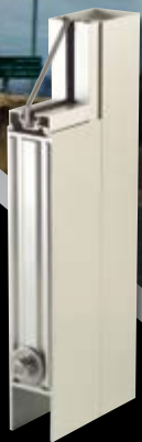
Standard Narrow Stile Entrances