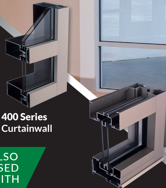
400 Series Curtainwall

The strength and flexibility of steel tie-rod construction is what holds it all together and makes our doors endure. Tie-rod assembly is as durable as welded corner construction, but superior in many ways. Monumental doors can be modified, disassembled or resized right in the field. No other door offers you this much strength and flexibility.